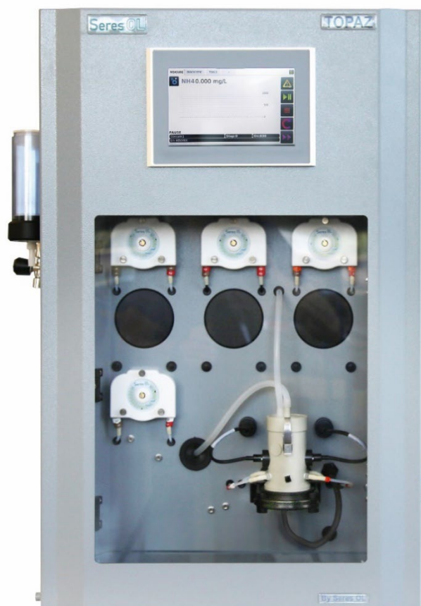
Seres OL Topaz Series Showcase